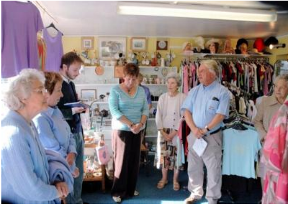
Blessings For the HELP Community Project