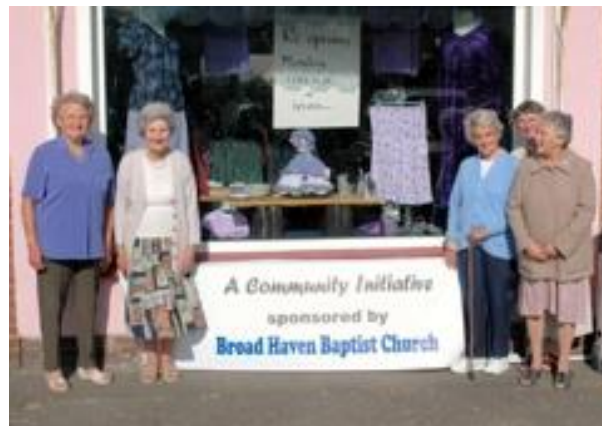
HELP Charity Shop Opening